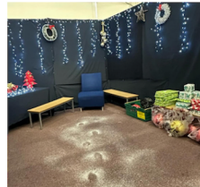
Santa's Grotto inside Fun Factory

the staff are always so happy and helpful. Well done to all, and thank you for putting on such a great day." We are immensely grateful for such kind words and are delighted to have provided an unforgettable experience for all who attended. Our Christmas party was a day filled with festive activities and joyous moments.