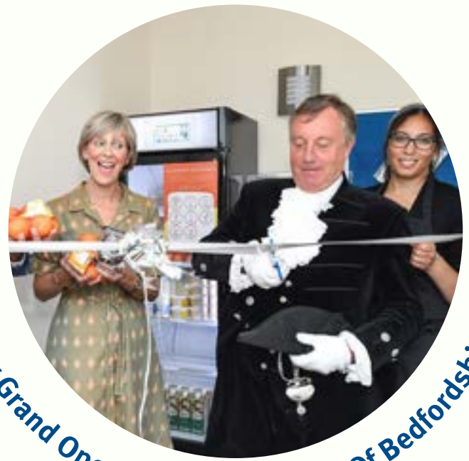
Our Grand Opening ft. High Sheriff Of Bedfordshire

Marsh Farm Futures launches Luton's first ever 'Community Fridge' as part of The Community Fridge Network in a growing effort to tackle food waste. Food waste is a big issue in the UK. The average household throws away £700 worth of food every year and at the same time, 4 million people in the UK are living in food poverty. Most food waste in the UK is avoidable and could have been eaten had it been better managed.