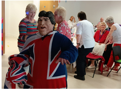
Queen's Platinum Jubilee