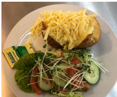
Futures Cafe hot food