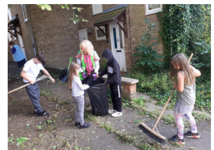
Residents unite to clear their local area