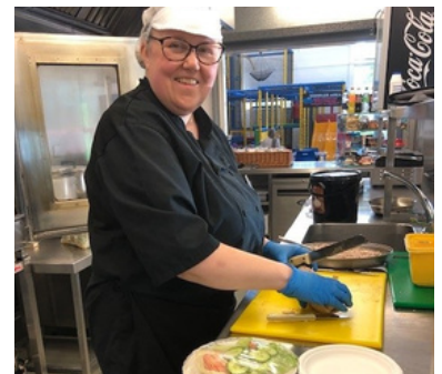
Futures Cafe Cook