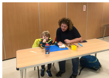
Groundworks in Futures Halls