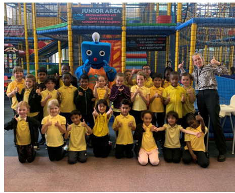
School Children give Fun Factory the thumbs up