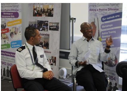
Att10tive using training space in Futures House