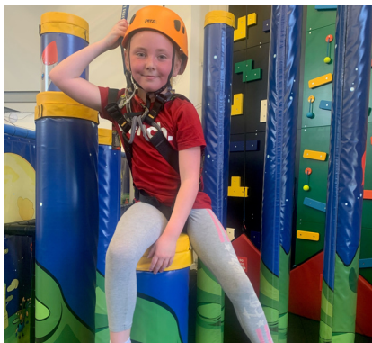
Stairway to Heaven in Futures Fun Factory.