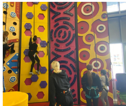
New climbing walls in FFF