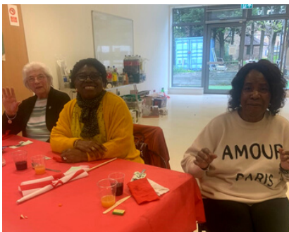
Happy guests at an MFF community event