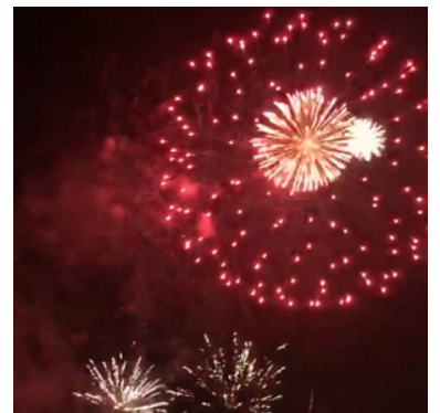
Marsh Farm Fireworks