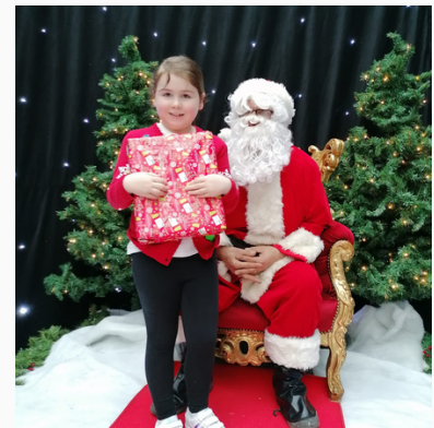
Santa, his reindeers and guests

At the event sponsored by Marsh Farm Futures, Marsh Farm Fundraising Group served free hot chocolate, doughnuts and hot dogs to everyone who came.