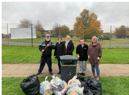
The volunteer clear up team after Marsh Farm Fireworks