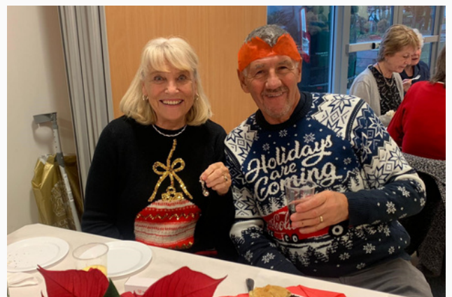
Guests at the party