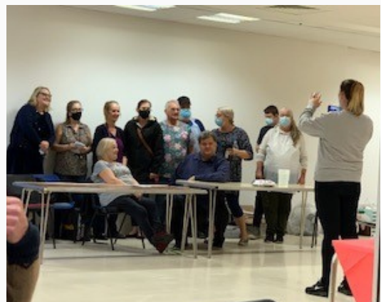
Volunteers at the event