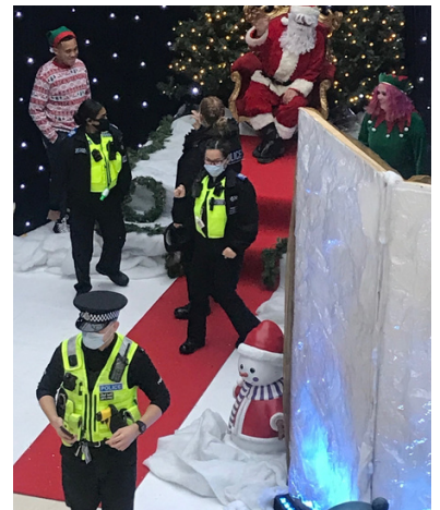
Beds Police with Santa