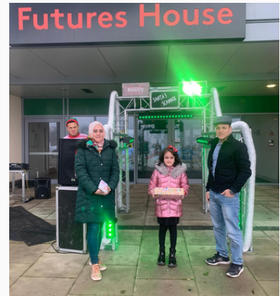
Families going through the naughty or nice machine

Children in Luton were lucky enough to meet Santa Claus at Futures House on Saturday 19th December 2021. He was accompanied by his elves who ensured that everyone went through the magical naughty or nice machine before seeing Santa in his amazing grotto and receiving a free christmas present.