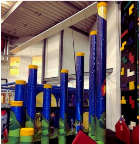
Stairway to heaven in Futures Fun Factory