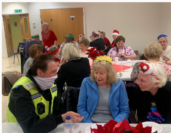
Beds Police chat to guests

"The entertainment put on was really appreciated especially in this trying times and my friends and myself would like you to convey our thanks to everyone."