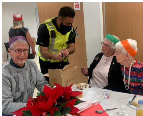
Senior Citizens Christmas Party