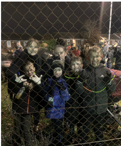
Excited children at the Marsh Farm Fireworks event