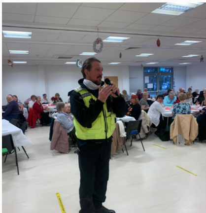
Click here to hear the singing PCSO