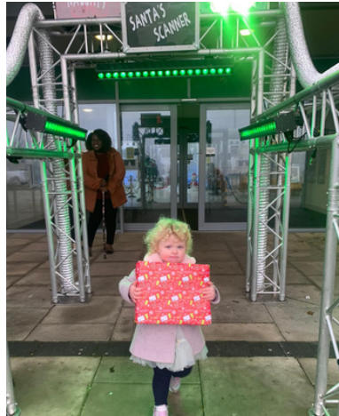
Santa's naughty or nice machine