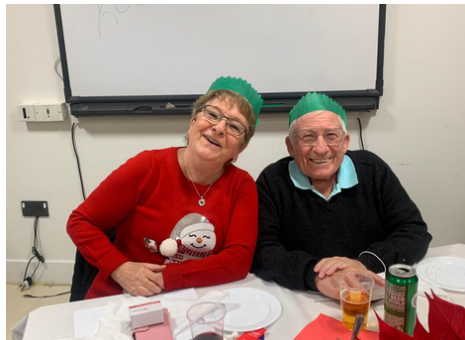
Senior Citizens Christmas Party