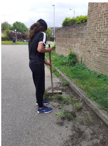
Neighbourhood clear up in Denmark Close 2021