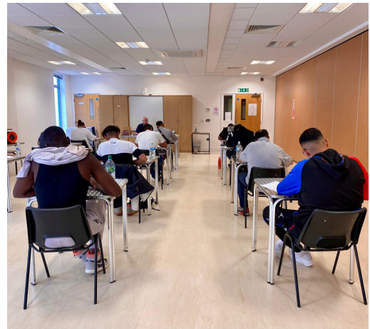
SIA Training in Futures House 2021