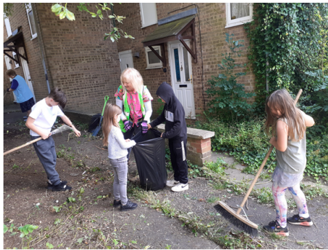
Neighbourhood clear up in Denmark Close 2021