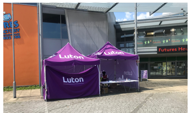
Covid Testing outside 2021