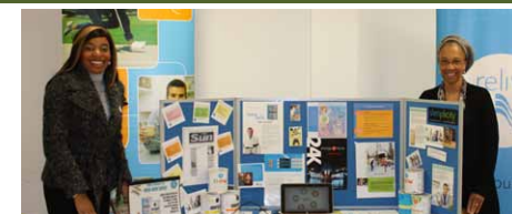
Women Enterprise Day