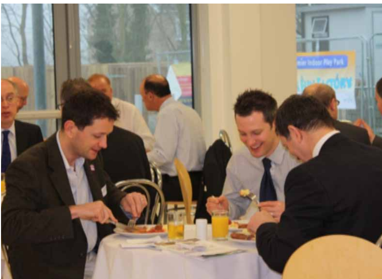
Futures Cafe Customers Enjoying a Brunch