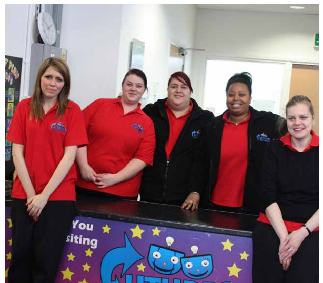
Fun Factory Staff waiting to Welcome you