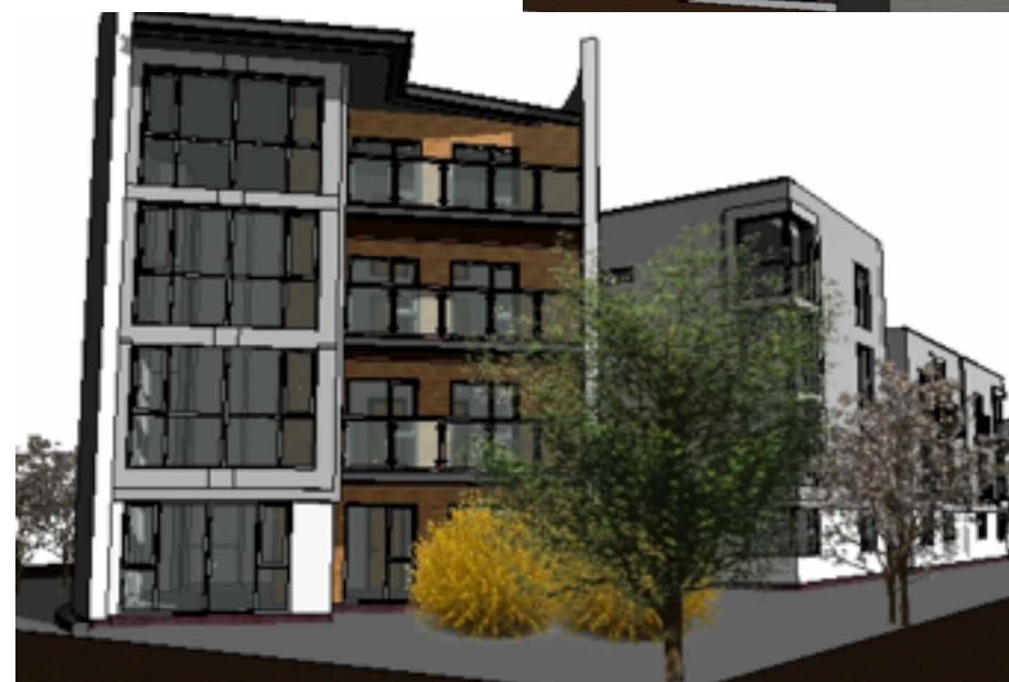
A sketch of different type of housing planned.