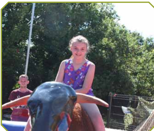
Summer Festival - August 2016